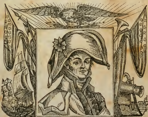
Commodore Porter, the Hero of the Pacific.—Page 213.